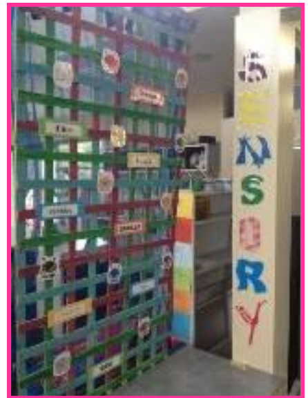
Look, touch, feel and describe at the sensory play table.