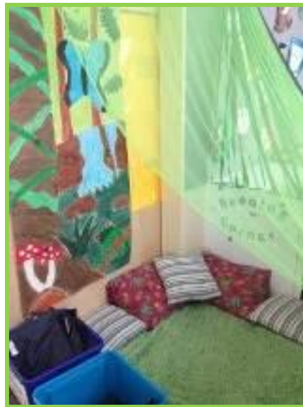
The rainforest reading area—look out for the frogs!