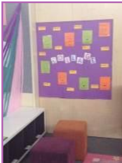
Create facial expressions in the collage area. 3