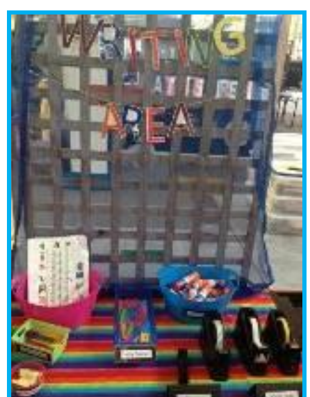
Access all the tools you need in the writing area.