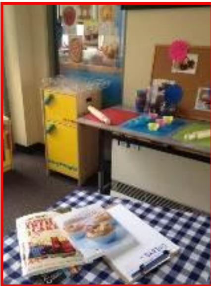
The bakery themed dramatic play area.

If you have walked into the Prep Learning Space over the last few weeks you may have noticed some changes. The Prep team is getting ready to begin Investigations. Below are some of the changes.