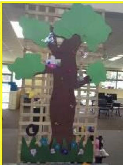
Enjoy the nature exploration table.