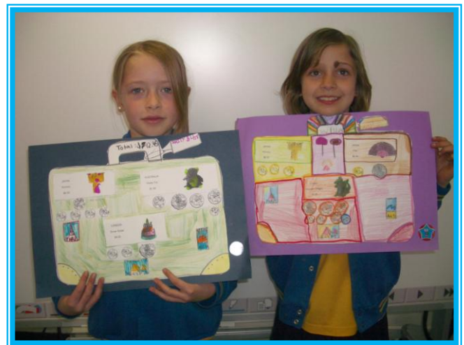
Amity and Angelina bought souvenirs from around the world

In maths, students learnt about money. They have learned to recognise the coins and notes used for transactions. They apply and connect what they have learned about money to real life situations such as ordering lunches and buying things by cutting out the correct amount of coins and finding totals.