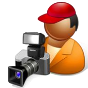
Photo order envelopes need to be returned to school on 'Photo Day' .

Please be advised that schools do not have health insurance for student accidents. If you do not have private health cover and you would like to establish insurance for your child, JUA provide a 24 hour, 7 day a week cover for $21.00 for the year. You can contact them on 1800 252 264 or www.studenthealth.com.au