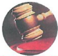
Prizes and Silent Auctions!

A community event collecting funds and supplies for the homeless population of Frankston.