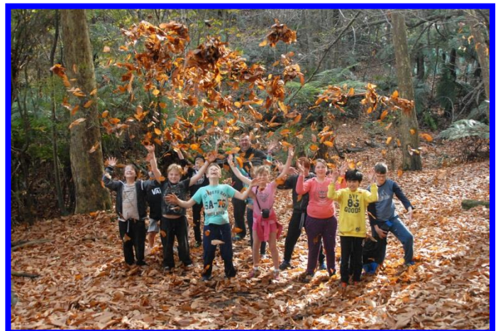
Having fun at camp!