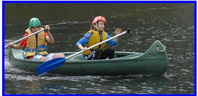
We sailed across the murky water with a muscular looking Viking with golden fine hair!