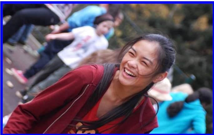
Having a laugh during the best days of our lives!