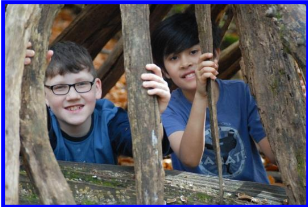
We had to make our cabins!!