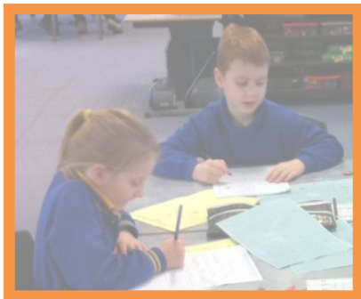
Students again working on activities in Language sessions