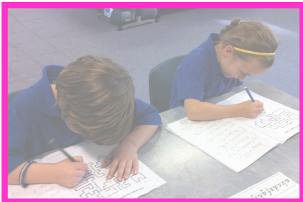
Students working hard in Maths sessions

This term the students have started off working hard in the Grade 1 classroom. We have been finishing off our recounts about the different toys our grandparents played with, and what children play with today.