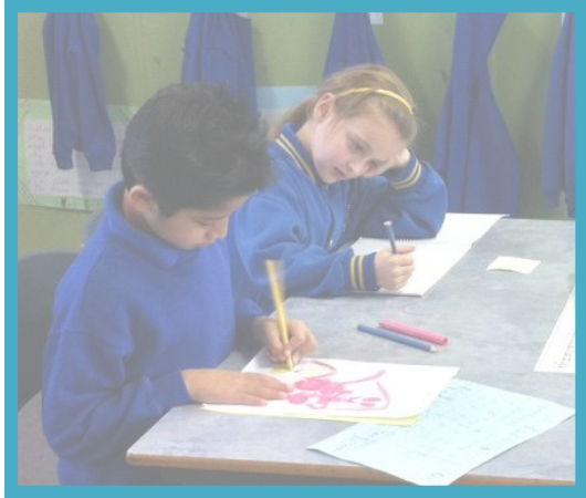
Students working on activities in Language sessions