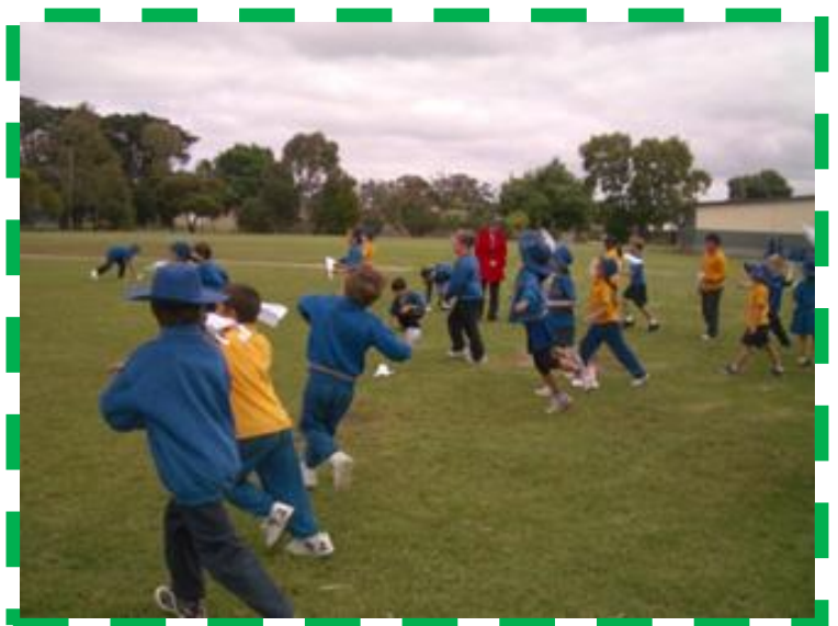
Planes have big wings and they move through the air with its engines.