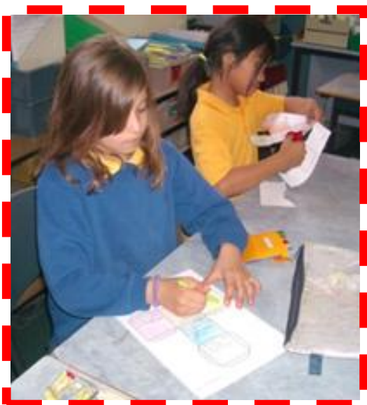
Hot Air Balloons carry people and we use them for fun!!

Over this term students in Grade 2 will be learning about different kinds of transport. Students have already learnt about planes and hot air balloons. Here are some comments from our Grade 2 students. Enjoy!